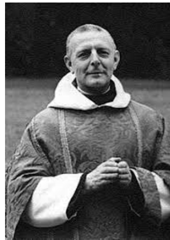
Dom Gregory Dix, Monk of Nashdom (1901-1952)

Was ever another command so obeyed? For century after century, spreading slowly to every continent and country and among every race on earth, this action has been done, in every conceivable human circumstance, for every conceivable human need from infancy and before it to extreme old age and after it, from the pinnacle of earthly greatness to the refuge of fugitives in the caves and dens of the earth.